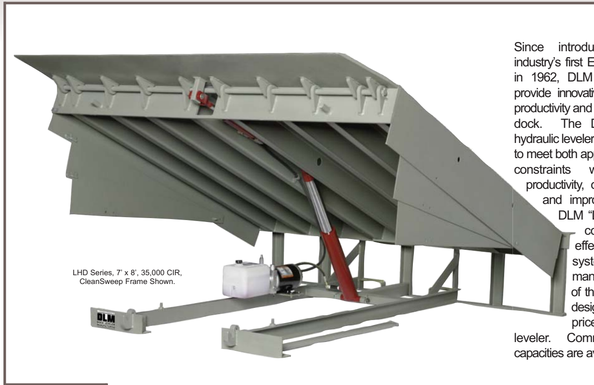
LHD Series, 7' x 8', 35,000 CIR, CleanSweep Frame Shown.

Since introducing the freight industry's first Edge-of-Dock leveler in 1962, DLM has continued to provide innovative ways to improve productivity and safety at the loading dock. The DLM "LHD" Series hydraulic leveler is value engineered to meet both application and budget constraints while maximizing productivity, optimizing efficiency and improving safety. The DLM "LHD" Series leveler combines a cost effective hydraulic system with the manufacturing efficiency of the "Lug Hinge" deck design to produce this price sensitive dock leveler. Common sizes and capacities are available.