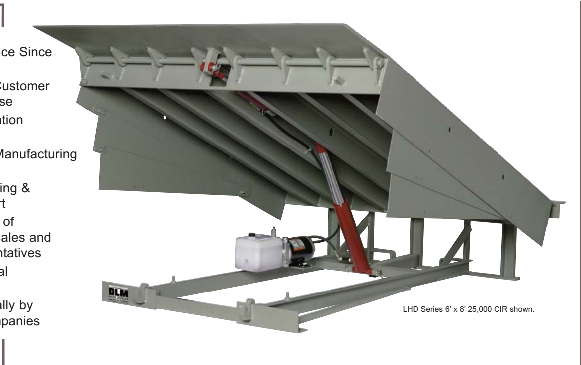
LHD Series 6' x 8' 25,000 CIR shown.