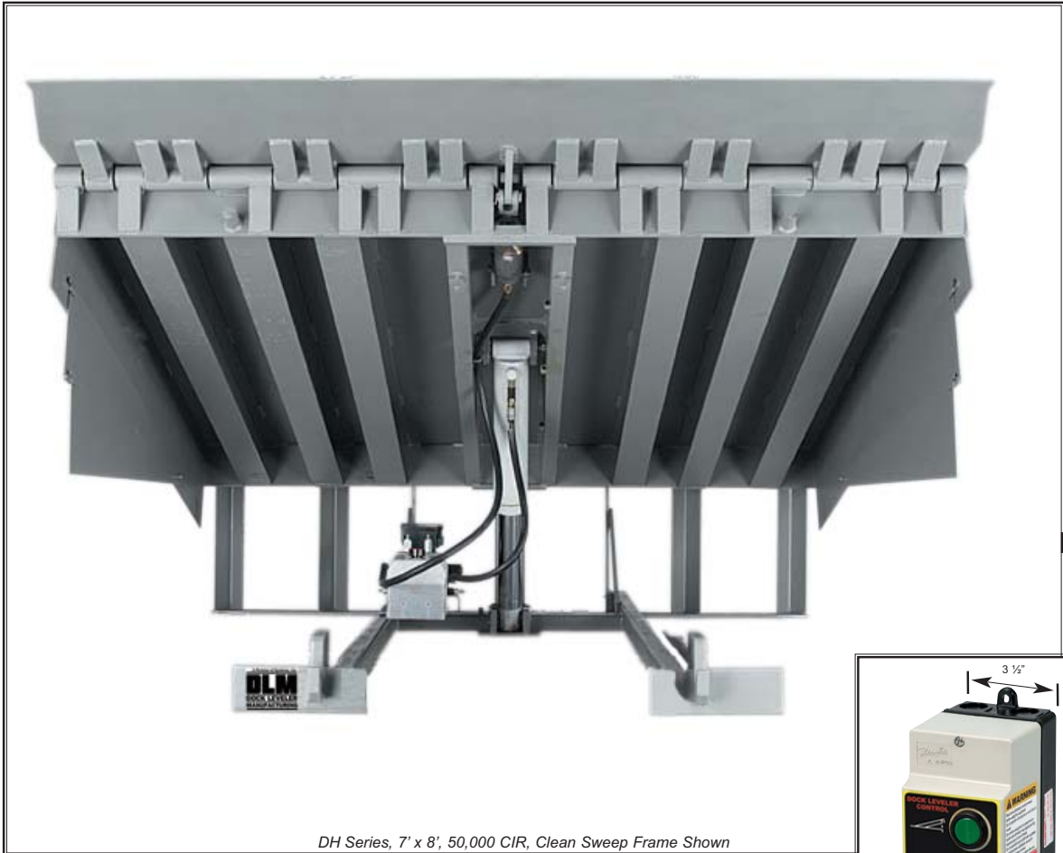
DH Series, 7' x 8', 50,000 CIR, Clean Sweep Frame Shown