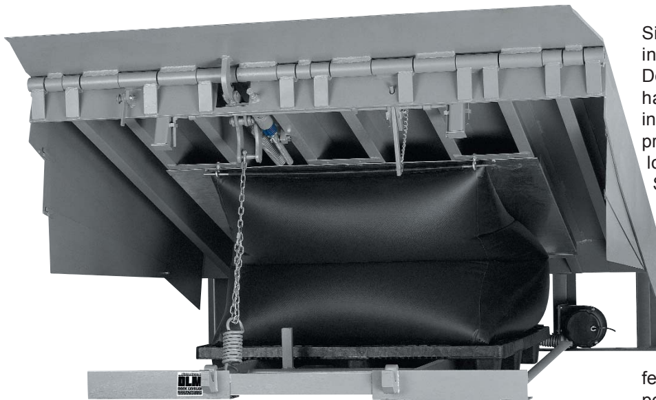
DA Series, 7' x 8', 40,000 CIR, Full Range Toe Guards.

Since introducing the "freight industry's" first Edge-of-Dock leveler in 1962, DLM has continued to provide innovative ways to improve productivity and safety at the loading dock. The "DA" Series Leveler combines the "push-button" convenience of hydraulic levelers with the economics of a mechanical leveler to bring value and performance to your loading dock. From superior structural design to unlimited operator features, the "DA" Series air powered leveler is a wise investment.