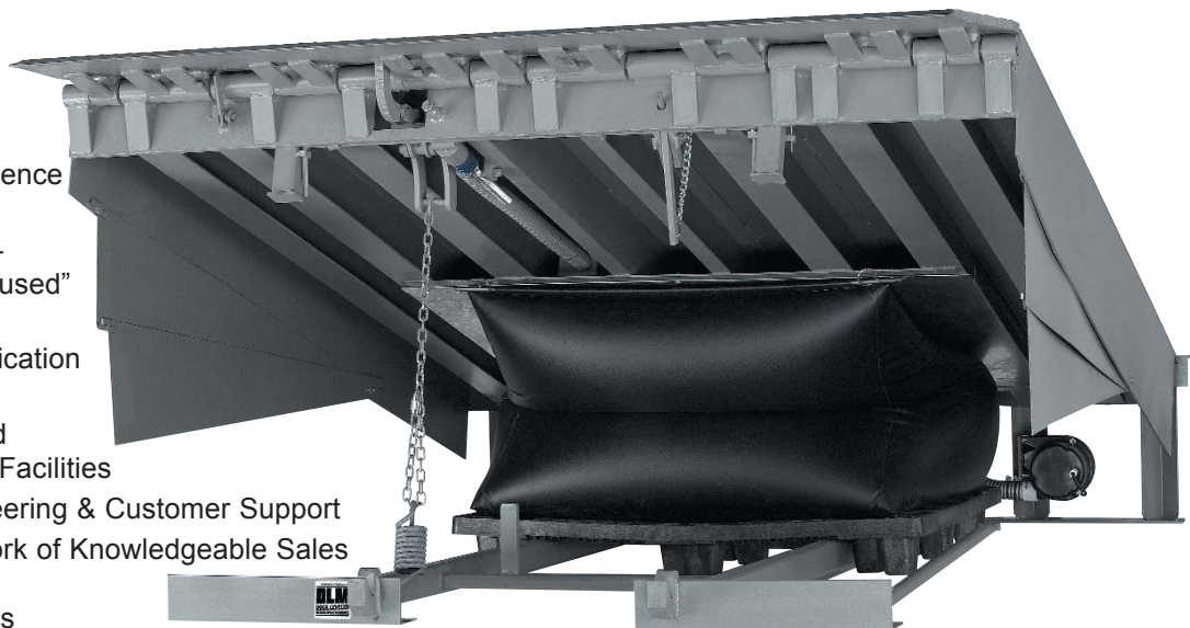
DA Series, 7' x 10', 50,000 CIR, Full Range Toe Guards, CleanSweep Frame™

Since introducing the "freight industry's" first Edge-of-Dock leveler in 1962, DLM has continued to provide innovative ways to improve productivity and safety at the loading dock. The "DA" Series Leveler combines the "push-button" convenience of hydraulic levelers with the economics of a mechanical leveler to bring value and performance to your loading dock. From superior structural design to unlimited operator features, the "DA" Series air powered leveler is a wise investment.